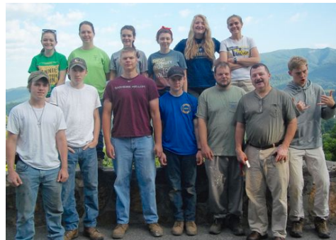
MLUMC's youth traveled to Marion, VA on mission to help low income families with home repairs and renovations.

The newly expanded Food Lift program is supplying many pounds of food for the needy. Several new people joined this program during the past year.