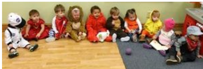
Tiny tots and super-tots dressed for Halloween

Therefore be imitators of God, as beloved children. And walk in love, as Christ loved us and gave himself up for us, a fragrant offering and sacrifice to God. EPHESIANS 5:1-2