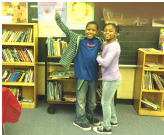
Readers in our Northside reading program.

remains in the nursery. Children in kindergarten and above will continue to attend Kids Praise with Kim Rhoton. If you are a current Kids Praise or nursery volunteer, your help is still needed during the 10:45 service to assist in the nursery, the preschool room, or in Kids Praise. New volunteers are encouraged to contact Kim Rhoton ( krhoton@mlumc.org ). The funding for these nursery attendants comes from the Brookline Endowment – thank you for your support!