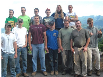
2016 Youth Mission Trip

Mission Work in Virginia This year's youth mission team worked with Project Crossroads in Marion, VA.