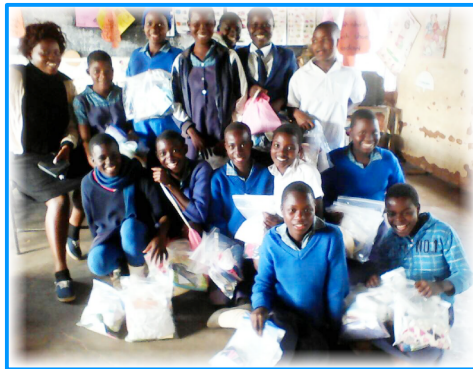
Nyadire girls with their Girl Empowerment Pads kits

Come to the TNC sewing party and help tackle a problem for young women in Zimbabwe. Girls are not permitted to attend school during their periods if they cannot obtain sanitary pads. At this party we'll assemble kits of cut material, needles, and thread to be shipped to Zimbabwe for the girls to make reusable sanitary napkins. Girl Empowerment Pads, we call them.