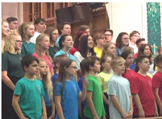
Butterflies performing for MLUMC