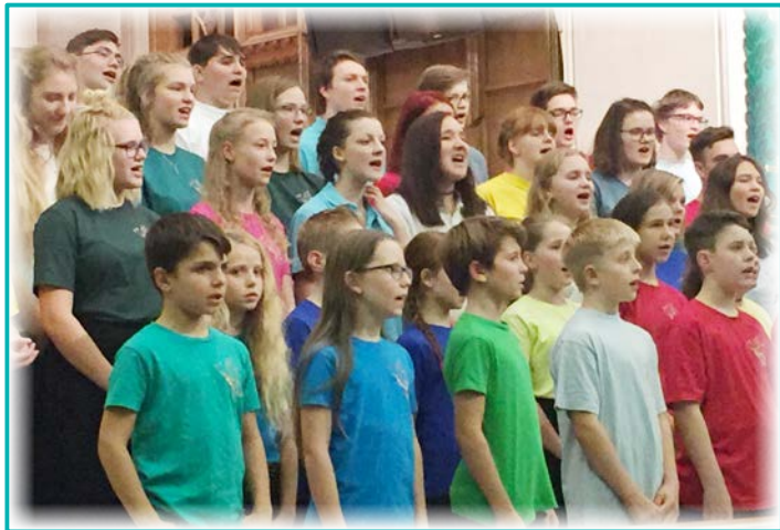
The Schmetterlinge (Butterflies) perform for MLUMC