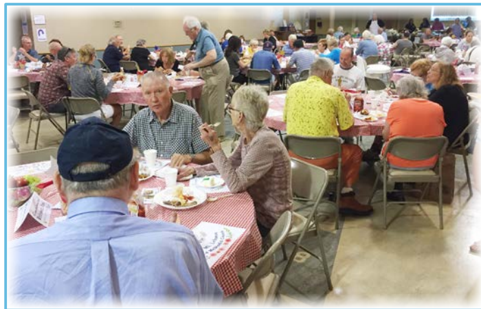
The 2017 Community Barbecue

The MLUMC Community Events and Outreach Committee, formed in August 2016, recently "celebrated" its one year anniversary and is still going strong!