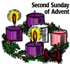
Second Sunday of Advent

Sun. Dec. 31, New Year's Eve Morning Worship - 10:45 service only, in Sanctuary