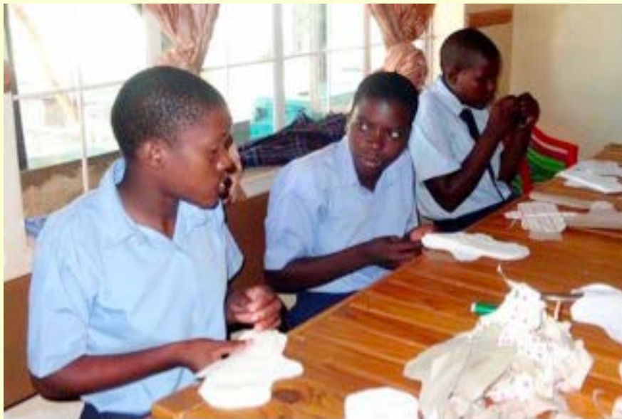
Nyadire girls with their Girl Empowerment Pads kits

No experience is necessary to cut fabric and put the kits together at the party, but bring scissors to use and items to donate. Kit items needed include new girl's underwear, sizes 10 to 14, misses sizes 5, 6 or 7; needles, thread, and fabric; and bars of soap, any size. Be a part of this important mission, its fellowship and fun. Information and to RSVP: Bonnie Lawson 412-489-6182 bonnielawson58@comcast.net .