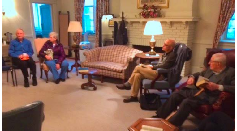
The adult Sunday school, Kerygma, hosting Coffee Café