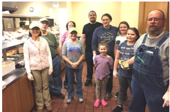
The MLUMC serving crew, including three generations of family