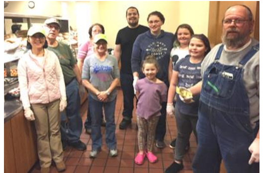
The MLUMC serving crew, including three generations of family