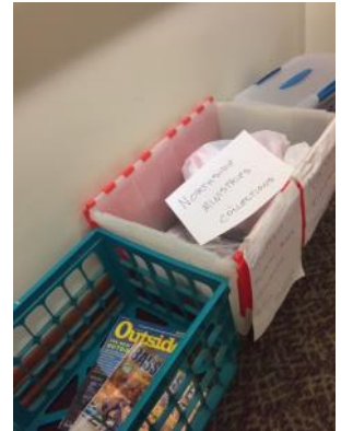
Collection bins across from Wesley Hall

A big Thank You goes out to the individual(s) who contributed books for the Allegheny County Jail. They were delivered this past Monday. Know that the Chaplain's Office at the Jail gratefully receives magazines (tear off your address label) and paperback books for it's circulating "library". MLUMC collects these items under the Education Building bulletin board across from Wesley Hall and delivers them on periodic Mondays. Please also drop off unused hotel toiletry items and clean socks for our Northside Lunch guests who are experiencing homelessness. These items are delivered monthly as we serve lunch on the first Thursday. Thanks for your help.