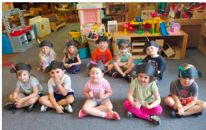
Children learn about Yankee Doodle.

We need afternoon help! If you know of anyone who might want to join our team, please have him or her call us!