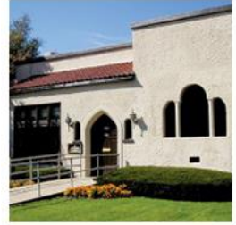
794 Washington Rd.