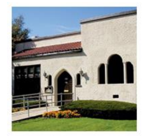
Historical Society 794 Washington Rd.

Take a trip to The Historical Society of Mount Lebanon on Washington Rd. to see our church's role in The Society's new exhibit, "Houses of Worship in Mt. Lebanon." MLUMC and our volunteer