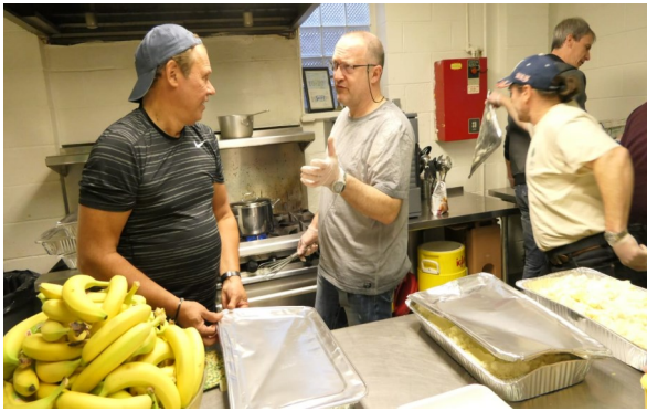
Our German guests preparing lunch and care packages for homeless people on the Northside

Since 1996 our two churches have grown in friendship, fellowship, prayer, missions, and spreading God's love and grace.