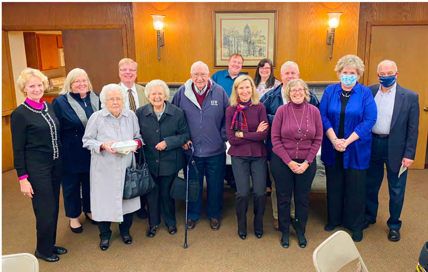
Some of the 25 people who attended The Albright Society dinner meeting on November 5.