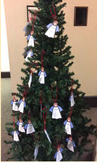
The 2019 Angel Tree

The Angel Tree is back, this year supporting the local organization, Hello Neighbor. You can find the tree in the Middle Narthex around November 20th. Each paper angel will list an item that is listed on the "Pressing Needs" list of Hello Neighbor and will be distributed to new immigrants in the Pittsburgh area. After you purchase the item, just return it to the base of the tree (no need to wrap anything).