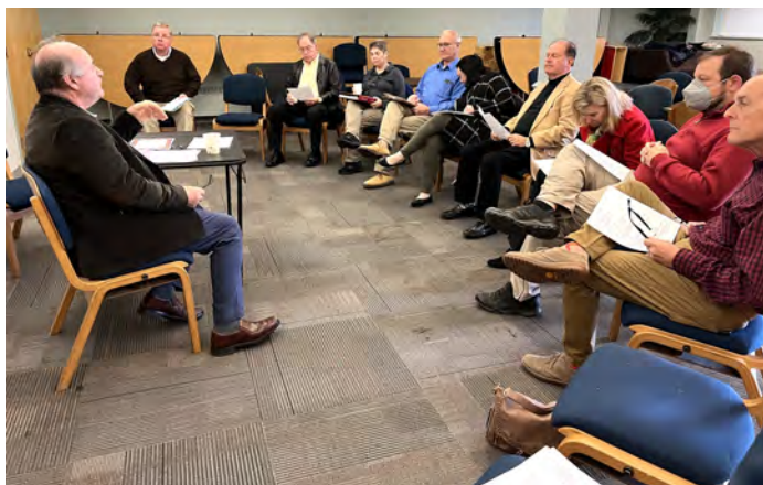
Recent meeting of the Vision Team