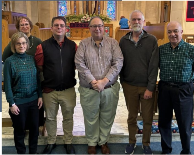
NEW MEMBERS AND THEIR SHEPHERDS