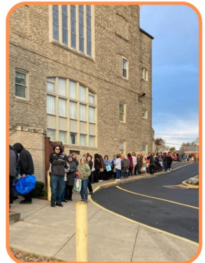
2023 Fall Rummage Sale, line out the door

THANK YOU IN ADVANCE FOR YOUR SUPPORT OF THE JUNE 1ST RUMMAGE SALE.