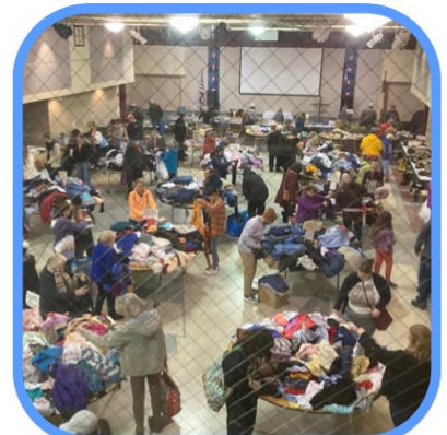
Asbury Center full of rummage & shoppers